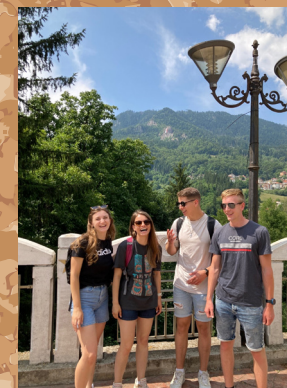
SAR Officer Cadets