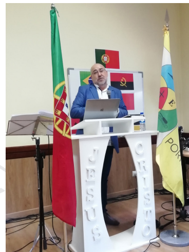
MEP bible teaching

We had some very good and enriching Bible teaching from the Director of the Theological College.