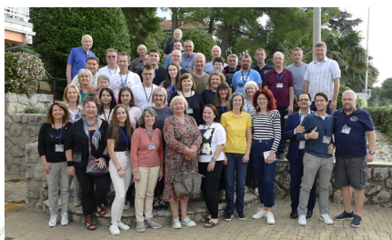
The Adria Interaction group

The conference provided a well-balanced mix of spiritual depth, personal engagement and leisure. On Friday an excursion was organised to the caves of LOKVARKA, followed by a lunch and a walk through the woods, giving wonderful opportunities to meet and interact. There was also ample time to meet each other over the wonderful meals and the free time.