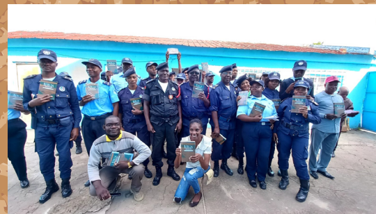
Angola bible distribution