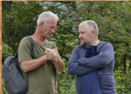
The Adria MMI team