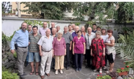
Bulgaria MCF 25th anniversary

On 16th September 2023 the St George Bulgarian MCF celebrated its 25th Anniversary.