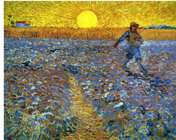
The Sower: Vincent van Gogh