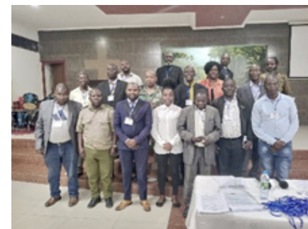
AMPBCA, Baptist Church, Luanda

At the beginning of November, the Angolan MCF held their third annual conference in the facilities of the Baptist Church, Luanda, with more than 20 delegates participating from Luanda and other provinces. The aim was to encourage the members, develop the association and approve the necessary statutes in order to continue with the official registration process.