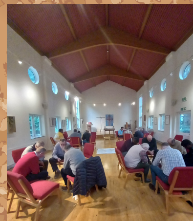
MMI Team & Trustee Retreat: Left and right praying for the MMI regions. Below: very boggy prayer walk.