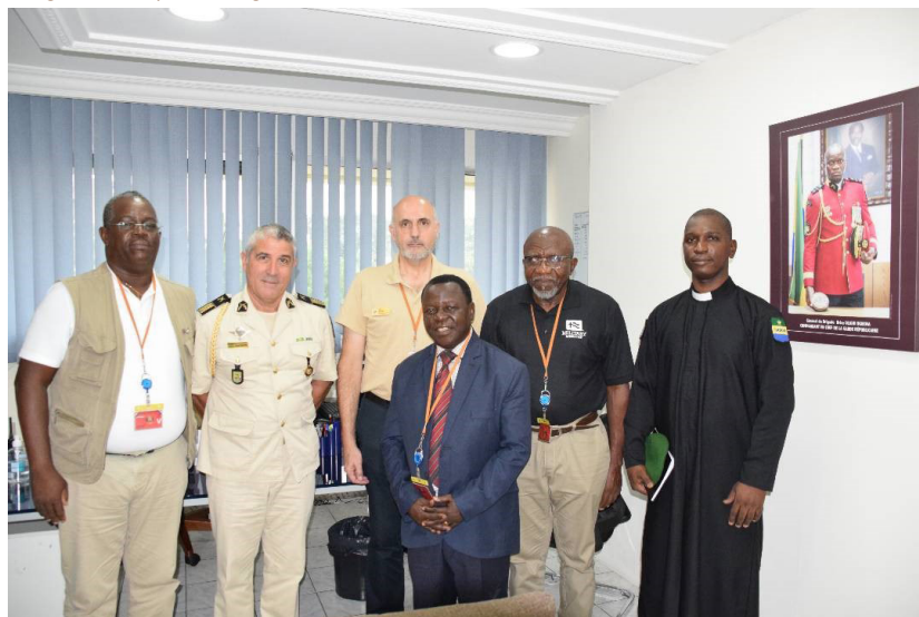
Meeting at the Republican guard HQ

May the Lord Bless the Security Forces of Gabon and our Brothers and Sisters in Christ!