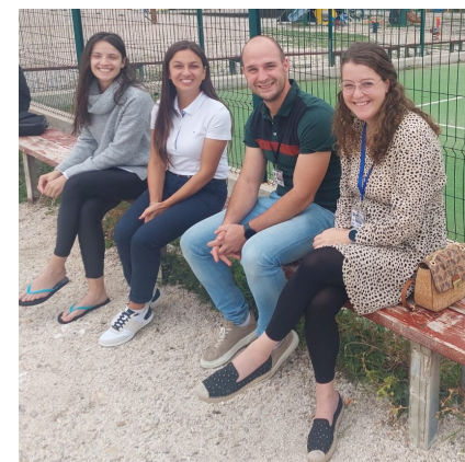
Above: Group of Young delegates

This was definitely a prayer-based and Spirit-led international gathering of military Christians. Despite the complex international situation in Europe, Adria Interaction brought together representatives from different European countries, including Croatia, Italy, Romania, the Netherlands, UK, Turkey and Bulgaria. Adria Interaction'22 served as a space for young military Christians to connect and grow in fellowship, to pray together and dream together.