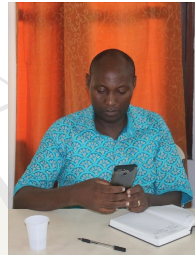
Page 14: Gabon MCF group.

As with similar International Association of Evangelical Chaplains (IAEC) training in Ghana, or Benin, this