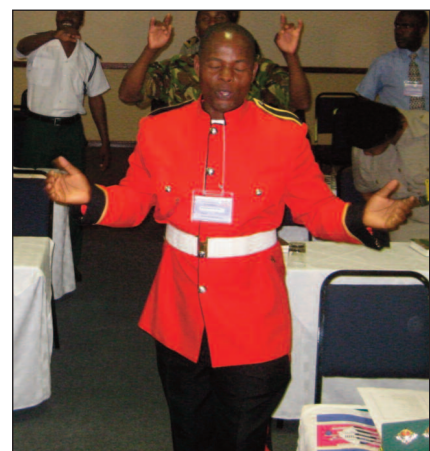
Pictures (clockwise from top): Conference opening ceremony; National dancing; "...lost in wonder, love and praise."; "Marching (and singing) in the power of God".