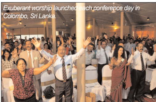
Exuberant worship launched each conference day in Colombo, Sri Lanka.