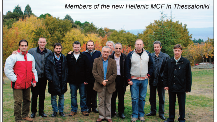
Members of the new Hellenic MCF in Thessaloniki

The next meeting of HMCF is scheduled for March 2012 in Athens.