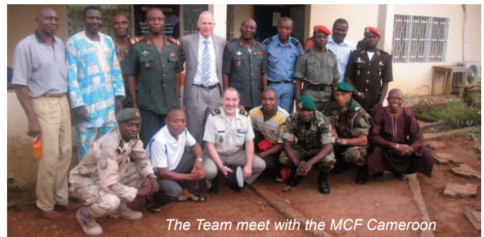
The Team meet with the MCF Cameroon