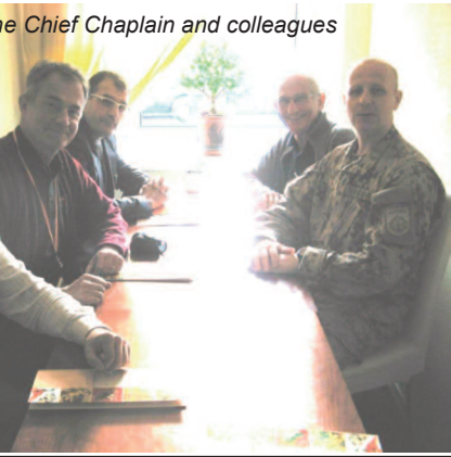
...the Chief Chaplain and colleagues