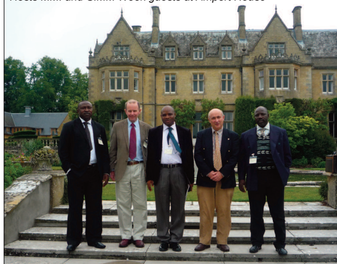
Hosts MMI and SIMM Week guests at Amport House