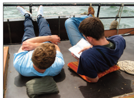
Pictures L to R: Intense sailing, Intense Bible study, Relaxed fellowship.