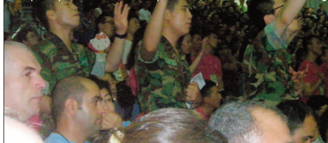
MEO participants share in worship at the Korean MCF annual meeting

dents. MSO provide a great opportunity to change the situation in these countries and to see the Kingdom of God advancing. Most delegates had been identified by Korean missionaries of which there are over 20,000 around the world. We are blessed and challenged by our brothers and sisters in MSO; join us in thanking God for them.