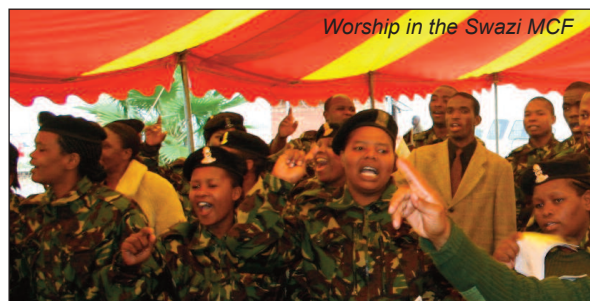
Worship in the Swazi MCF