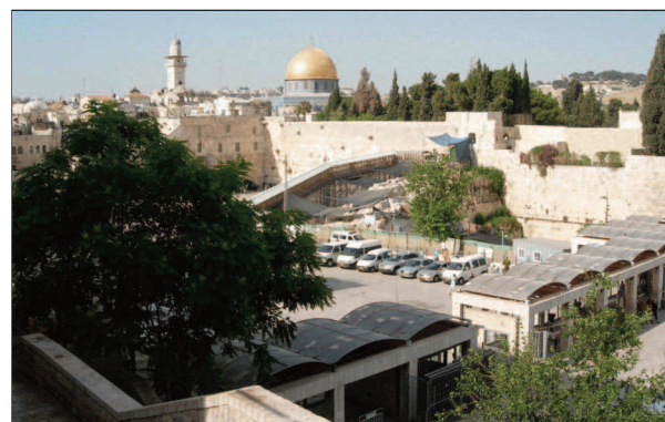
The very familiar mosque, the Dome of the Rock (above) contrasting with a Church in Lebanon (right) is one image of the concerns of Christians in the Middle East