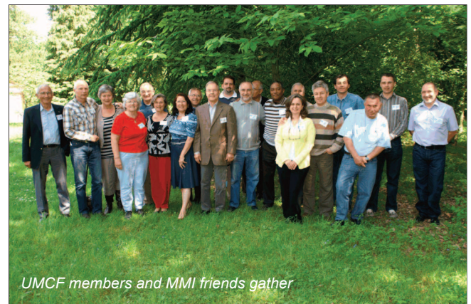
UMCF members and MMI friends gather