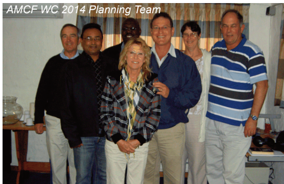
AMCF WC 2014 Planning Team

We must keep WC2014 in our prayers for the next 3 years.