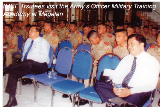
IMCF Trustees visit the Army's Officer Military Training Academy at Magalan

subject of continuous prayer, both for safety and courage in the face of persecution. It takes great personal courage to do all this in the face of the forces of Islamisation.