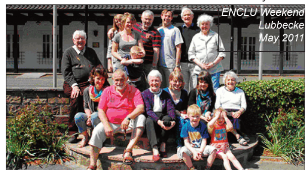
ENCLU Weekend Lubbecke May 2011

Lübbecke, Germany in May and said, "German, Dutch, Russian and UK representatives met for a fruitful time of fellowship, encouragement and exploring the future. Psalm 1 was important as we thought about bearing fruit, being generous and giving freely to all, but the fruit must die to bring more fruit," he continued "so in ENCLU we need to discern the most effective way forward."